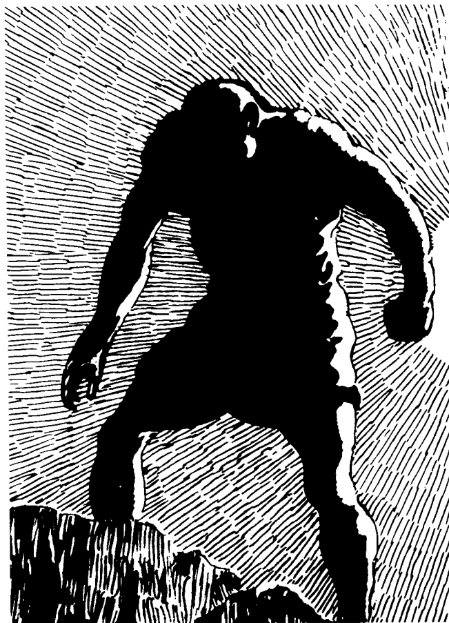
Cain called out to God, “My punishment is more than I can bear.”

Once again, God had to punish one of His human children for disobedience. But God's punishment is always done in love and for a reason. God doesn't punish out of hate. He doesn't seek to get even with the sinner or to make him pay for his