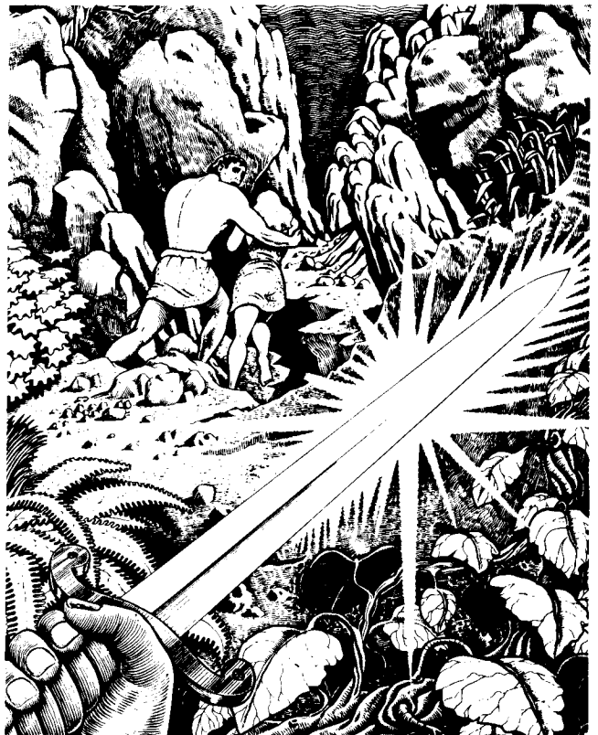
"God placed angels and a blazing sword at the only entrance to the Garden."

God also drove them out of their beautiful garden home. He knew it would be cruel to allow them to eat of the Tree of Life and live in unhappiness forever. God placed angels and a blazing sword at the only entrance to the Garden. They stopped anyone from entering the Garden