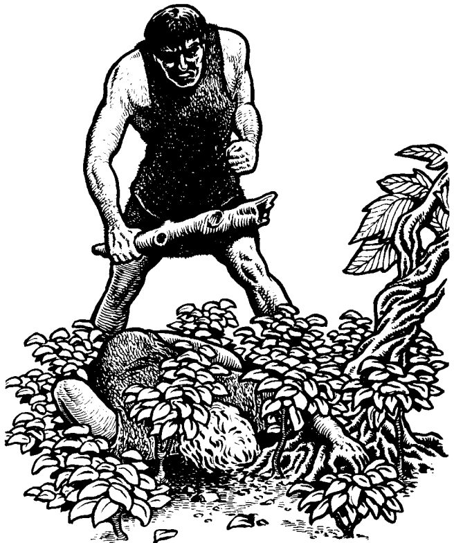
By allowing hate to control his mind, Cain became the world's first murderer!

Shortly after this, when Cain and Abel were alone in the field, Cain turned on his