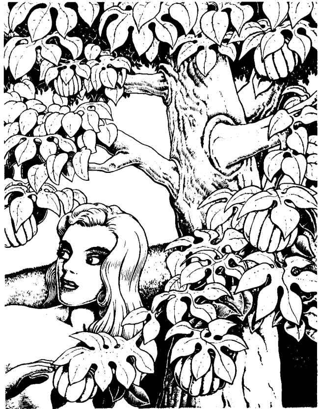
Eve finally gave in to temptation and took the fruit of the forbidden tree and ate it.

Satan, the sneaky serpent, had cleverly deceived Eve into believing his lies. She had been tricked. Eve didn’t know that she was making the wrong choice.